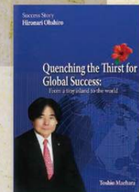
“Quenching Thirst for Global Success”