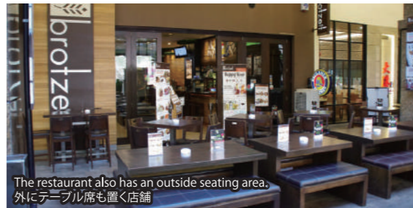
The restaurant also has an outside seating area. 外にテーブル席も置く店舗

Kangen Water is not only used in all of the cooking at Brotzeit, but is also used when diluting alcohol and for chasers. As Rogelio happily explains, "cleaning products are not needed anymore," strong electrolyzed water is used when cleaning the premises and cookware. Now, Brotzeit has successfully opened 7 branches, expanding throughout Asia, including 3 in Malaysia. The very first Leveluk, though, was installed in Mid Valley, the forerunner of all the branches. "I hope to eventually install Leveluk in other branches," Rogelio expresses his vision for the future.