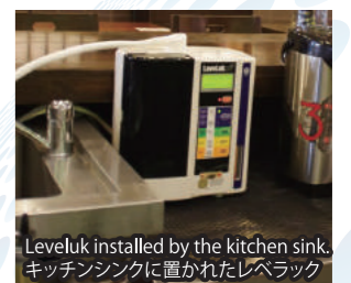
Leveluk installed by the kitchen sink. キッチンシンクに置かれたレバラク