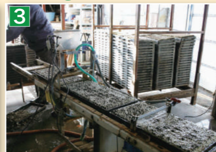
Seedlings are again treated with acidic electrolyzed water after a couple centimeters of growth. 数センチに伸びた段階で再び酸性電解水で消毒を実施