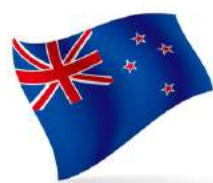
New Zealand ニュージーランド