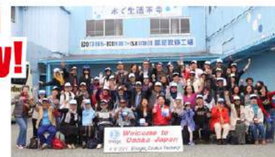
Malaysia team visiting the Osaka Factory. 大阪工場を見学したマレーシアチーム

まれ故郷である名護市で、エナジック瀬嵩カントリークラブとウコン工場、さらに会長の生家を訪問し、会長夫妻との懇親会もおこなわれ、参加者はエナジックの原点を体感しました。さらにエナジック美浜ボウリング場や天然温泉アロマなども訪れ12日に帰国の途につきました。