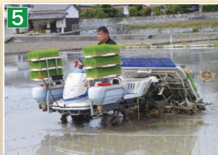
Transplanting of the seedlings grown in the greenhouse (first planting on April 10). ビニールハウスから搬出した苗を作付けする(4月10日の第一回の田植え作業)