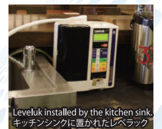
Leveluk installed by the kitchen sink. キッチンシンクに置かれたレバラック