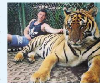
Boldly posing with a tiger during his trip to Thailand. 遊覧は人一倍? タイ旅行中に虎とたわむれる

らゆる努力を惜しまないという姿勢こそ、急速な昇格をもたらした秘訣ではないのか。今後の目標を聞くと「仲間一人でも多く6Aになってもらうこと、そして身体と経済の改善を可能にするエナジックを世界に広めること」と意気高く答えた。