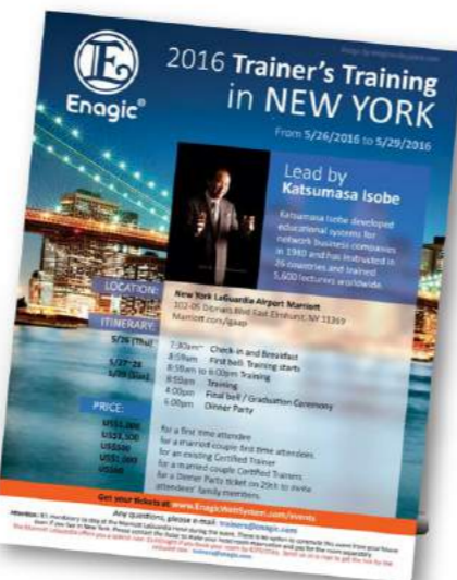
Poster promoting the training course in New York in May. 5月のニューヨークのトレーニングを告知するポスター