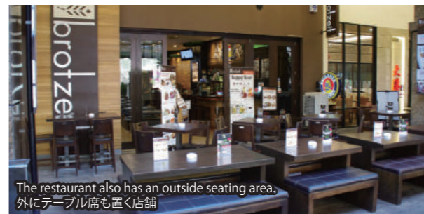
The restaurant also has an outside seating area. 外にテーブル席も置く店舗

Kangen Water is not only used in all of the cooking at Brotzeit, but is also used when diluting alcohol and for chasers. As Rogelio happily explains, "cleaning products are not needed anymore," strong electrolyzed water is used when cleaning the premises and cookware. Now, Brotzeit has successfully opened 7 branches, expanding throughout Asia, including 3 in Malaysia. The very first Leveluk, though, was installed in Mid Valley, the forerunner of all the branches. "I hope to eventually install Leveluk in other branches," Rogelio expresses his vision for the future.