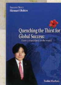
“Quenching Thirst for Global Success”