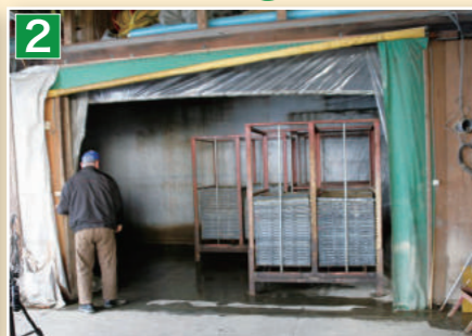
To speed up the germination process, rice seeds are kept in a heated room called muro. ムロと呼ばれる暖房のきいた部屋で種籾の発芽を促す