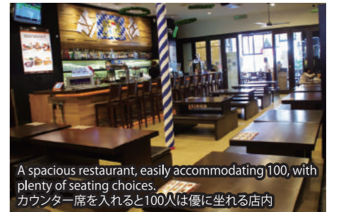
A spacious restaurant, easily accommodating 100, with plenty of seating choices. カウンター席を入れると100人は優に坐れる店内

Address: G(E)-018, Ground External Floor Mid Valley Megamall, Mid Valley City Lingkar Syed Putra, 59200 Kuala Lumpur Phone: 603 2287 5516