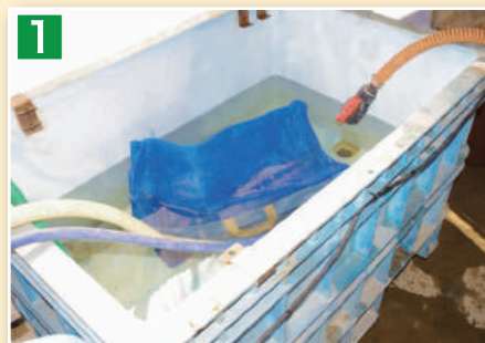
Rice seeds are disinfected in a tank filled with acidic electrolyzed water. 水槽に貯めた酸性電解水で種籾を消毒