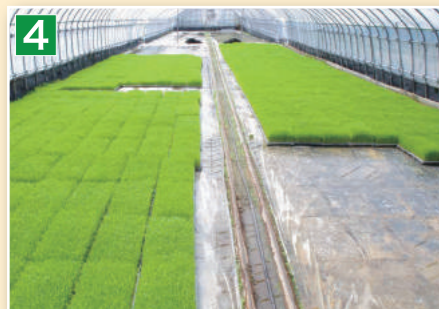
Rice seedlings are nurtured after being moved from a muro to a greenhouse. ムロからビニールハウス(温室)に移し生育させた苗